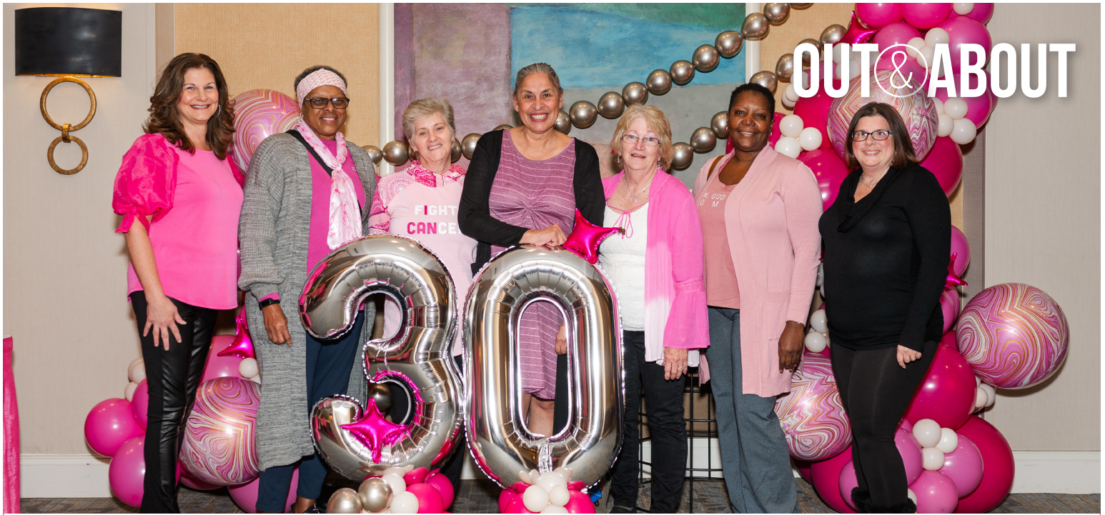
The PA Breast Cancer Coalition celebrated 30 years of advocacy and impact at the 2023 Conference in October.